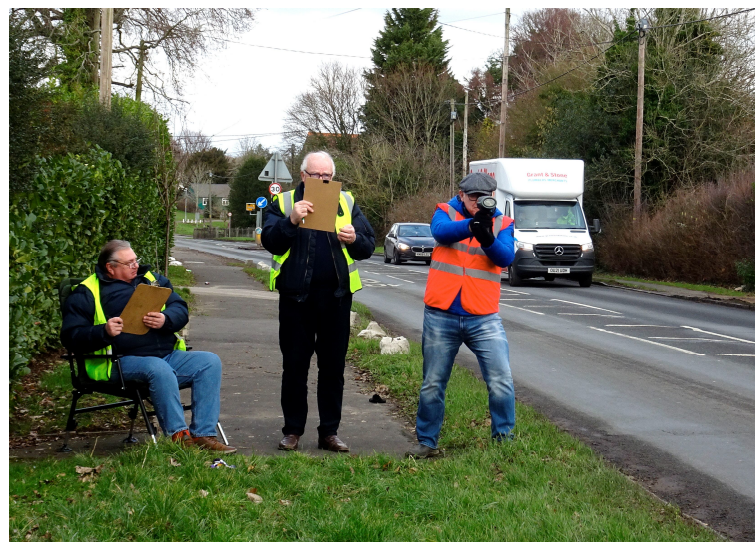
Here they are at work