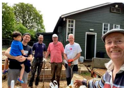
Some of the team!

Construction of The Glebe Cafe is progressing, and the scheduled opening date is Saturday 2 nd October, all being well.