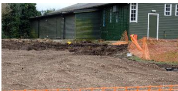
Right at the beginning

Here are a few pictures to show the site as work began,