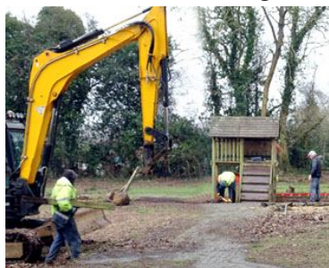
The digger moves in