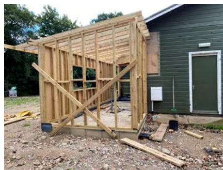
The Glebe Cafe

Once the area is inspected and signed off by the authorities, an official opening date will be circulated!