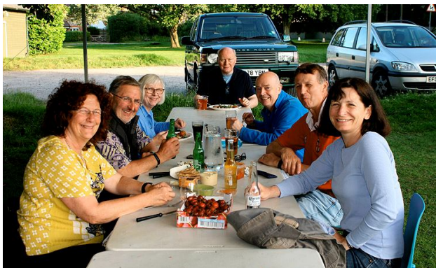
Some of the team relax

Later in the evening they came up for an evening together out on the green.