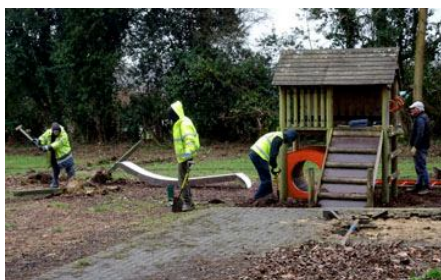
Removing the old playground kit